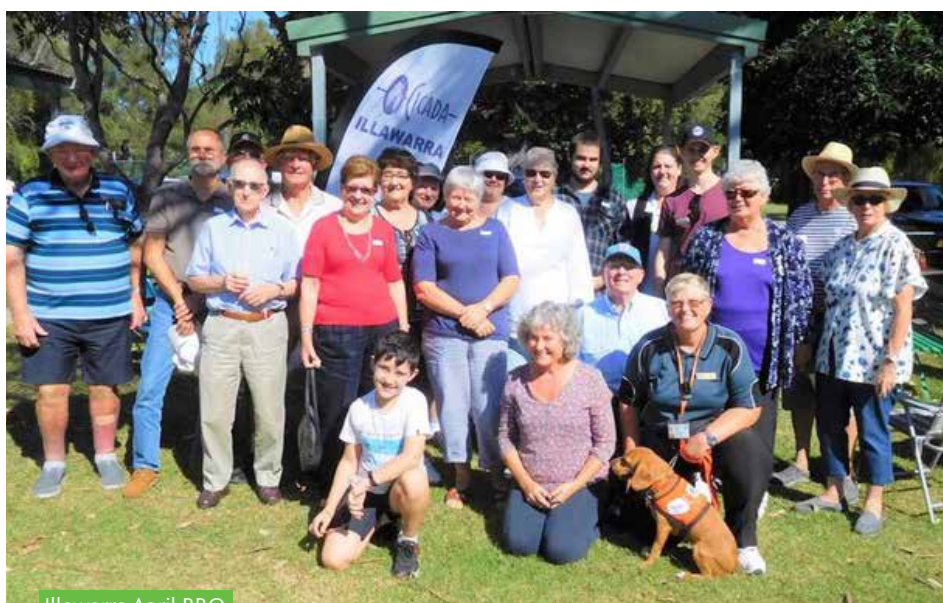
Illawarra April BBQ

Sunday 9th December Windang Picnic Parks Xmas Party